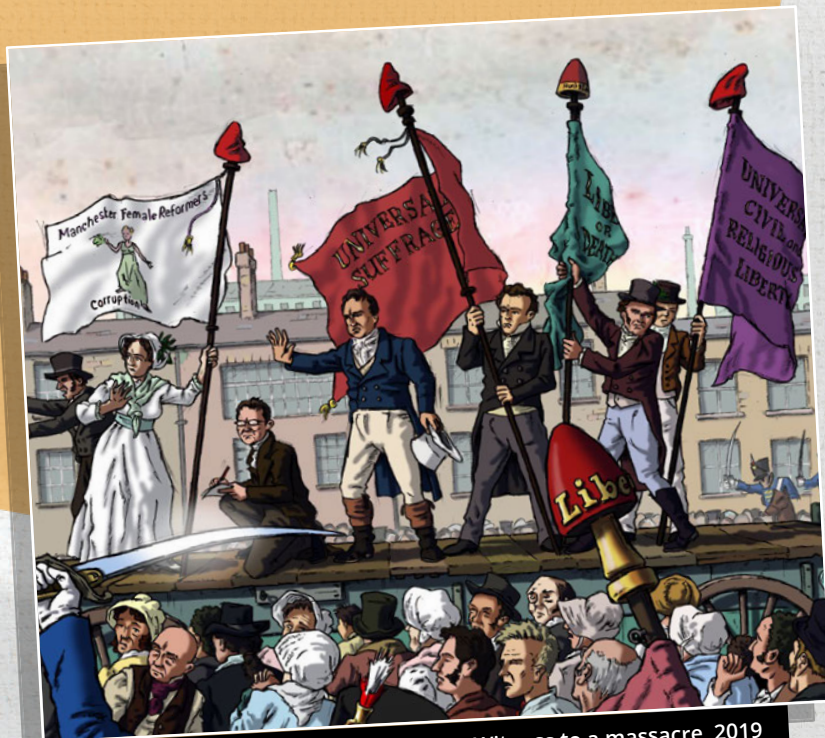
© Polyp Schlunke Poole, Peterloo - Witness to a massacre, 2019

In 1819 around 2% of the UK population had the right to vote and Manchester did not have its own Member of Parliament (MP).