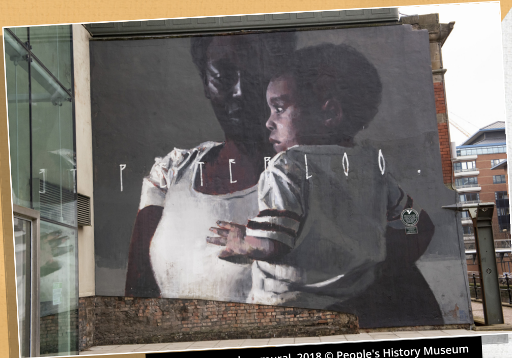
Axel Void, Peterloo. mural, 2018 © People's History Museum

USING THE NOP STRUCTURE ANALYSE THE FOLLOWING SOURCE: