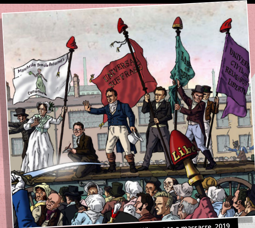
© Polyp Schlunke Poole, Peterloo - Witness to a massacre, 2019