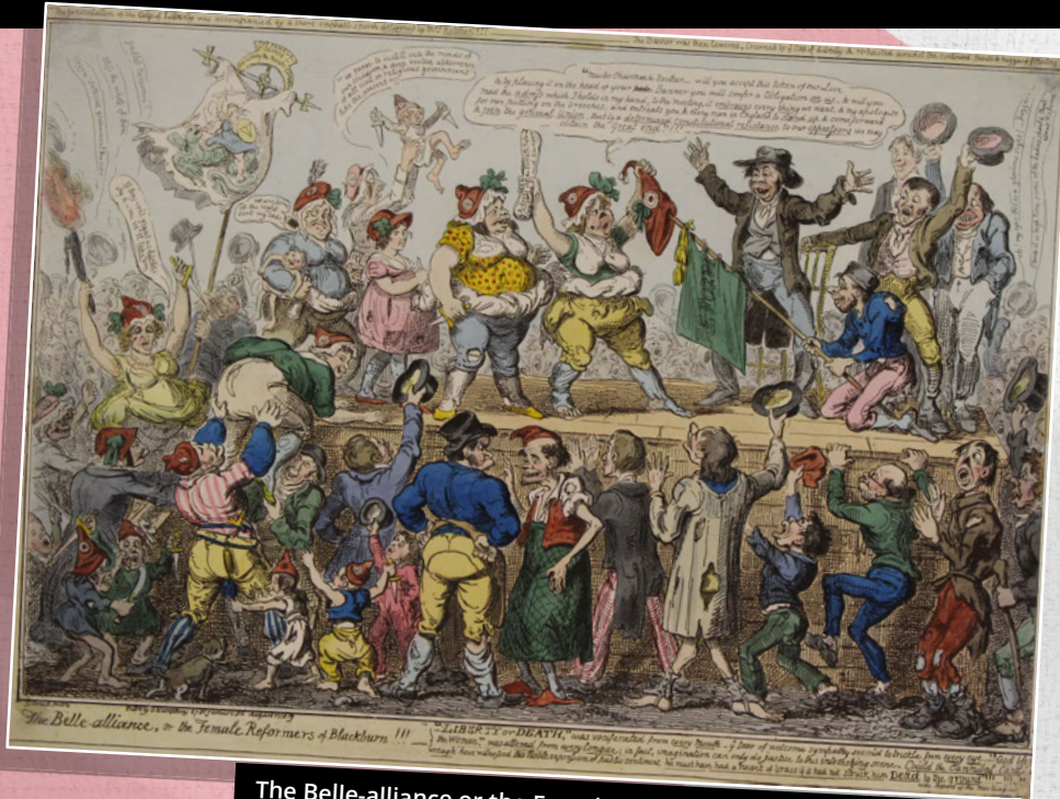
The Belle-alliance or the Female Reformers of Blackburn!!! print, 1819

Look at your copy of the source and describe: