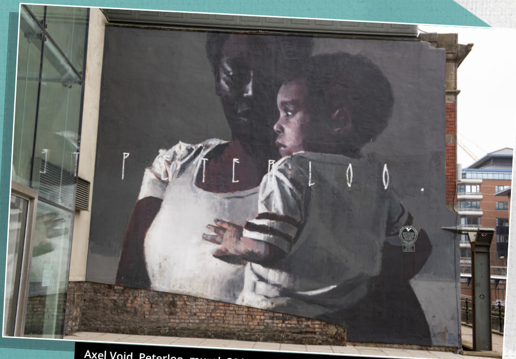
Axel Void, Peterloo. mural, 2018 © People's History Museum

Look at your copy of the source and describe: