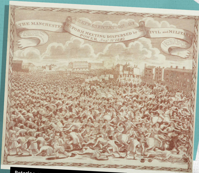
Peterloo commemorative handkerchief, around 1819

Look at your copy of the source and describe: