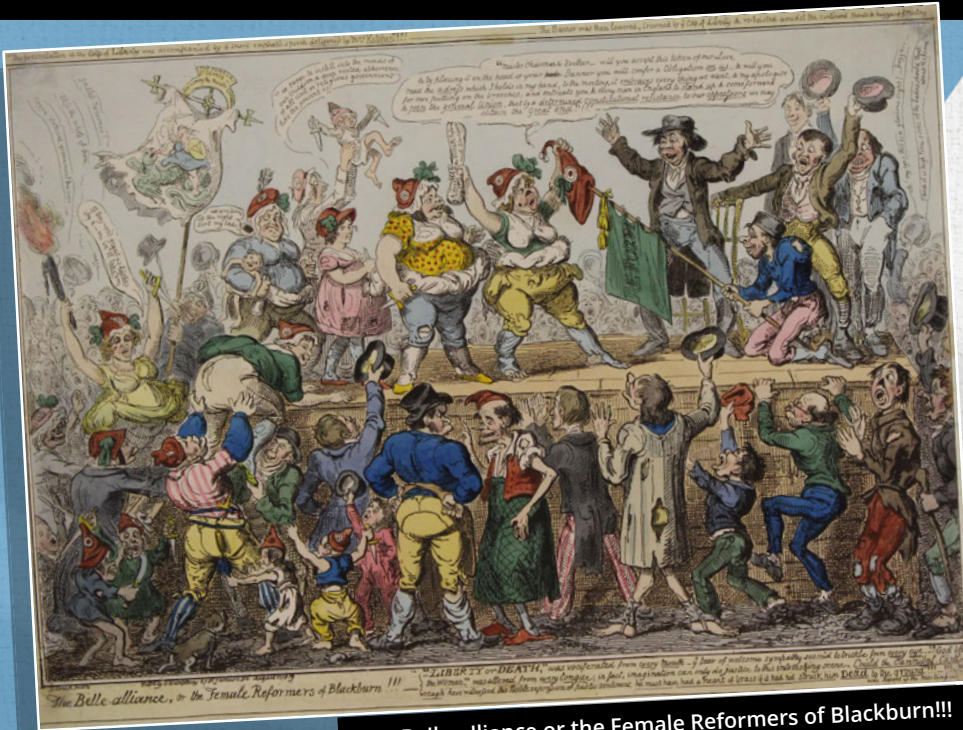
The Belle-alliance or the Female Reformers of Blackburn!!! print, 1819