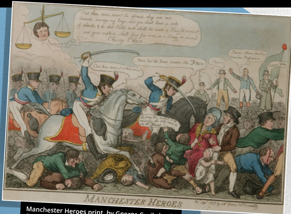
Manchester Heroes print, by George Cruikshank, September 1819

Look at your copy of the source and describe: