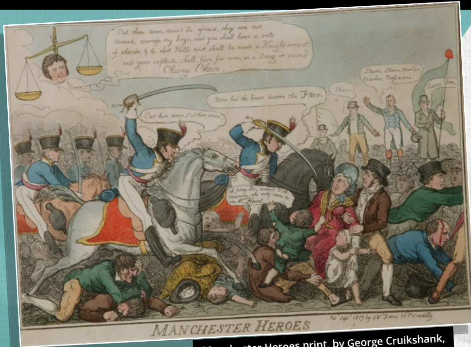
Manchester Heroes print, by George Cruikshank, September 1819

USING THE NOP STRUCTURE ANALYSE THE FOLLOWING SOURCE: