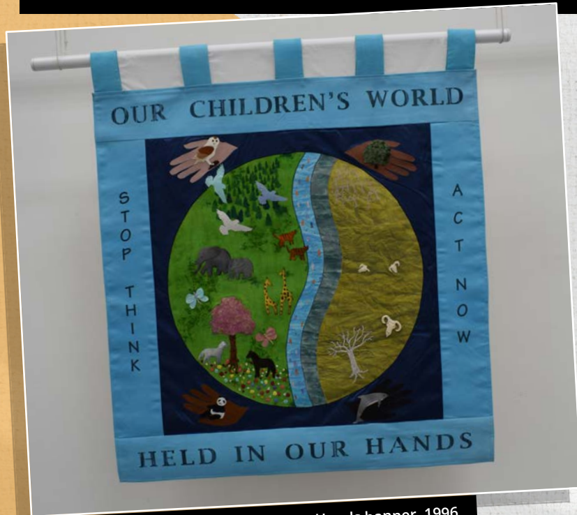
Our Children's World Held in Our Hands banner, 1996

Think of one thing people living in Manchester 200 years ago might have wanted to change about their lives.