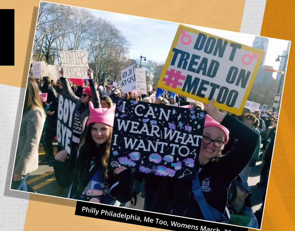
Philly Philadelphia, Me Too, Womens March, 2018

Teacher Notes: Writing to your MP https://www.youtube.com/results?search_query=Write+to+your+MP++Debbie+Abrahams+MP+for+Oldham+East+and+Saddleworth (Alzheimer's Society)