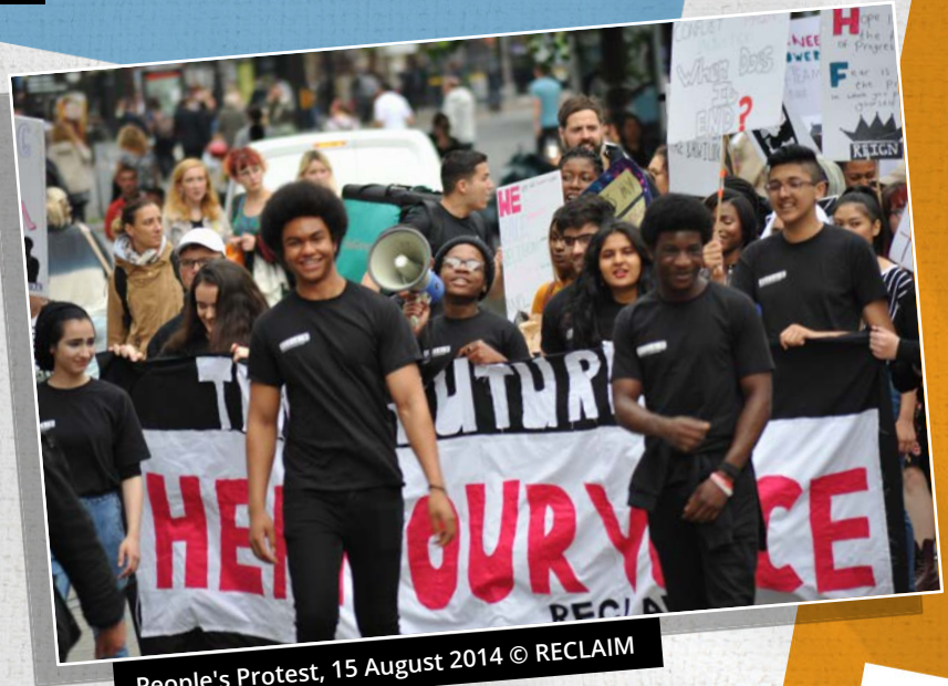
People's Protest, 15 August 2014

Teacher Notes: Extension Videos - What your MP does all day https://www.youtube.com/watch?v=6mXYbxtmzNU Working for you – contacting your MP https://www.youtube.com/watch?v=tmlonH4dTrY