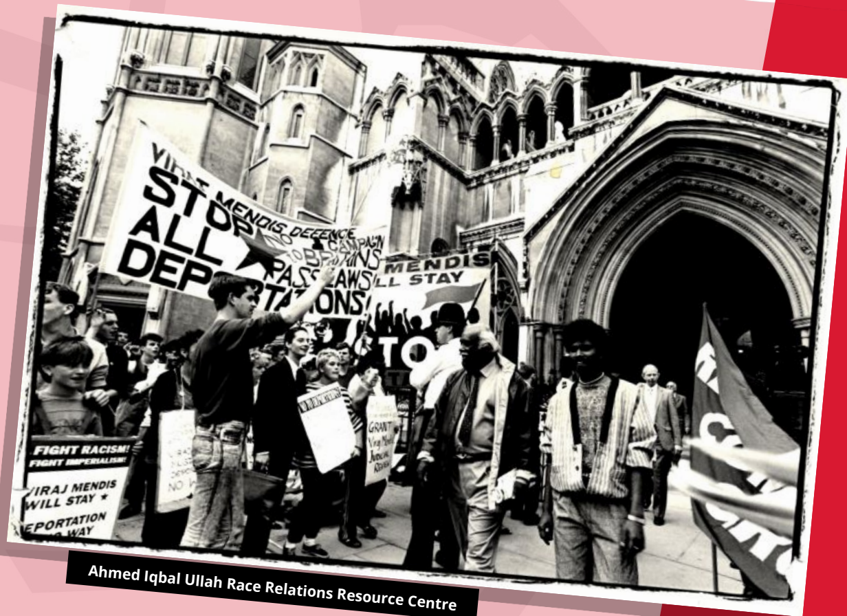
Ahmed Iqbal Ullah Race Relations Resource Centre